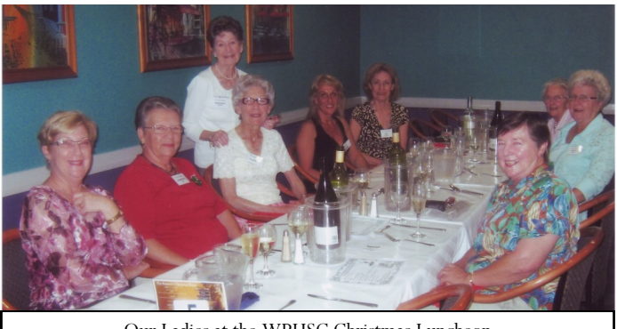
Our Ladies at the WPHSC Christmas Luncheon